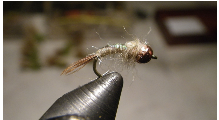
The Infamous 'Raidey Mite'