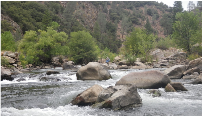
Raidey Mite water on the Kern

That's what the guy said. I was on Hot Creek having a good day. That in itself is an unusual occurrence. He had offered me his spot as I walked upstream. I declined at first, but he insisted, explaining to me that there weren't any fish there anyway. So after I had caught a good number of fishes in a short amount of time, he asked me the now famous question, "What fly are you catching those fish on?" I answered, "My Raidey Mite." "Let me see it." "OK, here." Which now leads to my all-time favorite fishing response, after looking at my fly, he matter of factly stated, "They won't take that fly here, it's much too big." This gets even better, I offered him a couple and he refused them, because he didn't think they would work on Hot Creek.